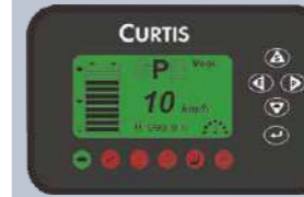
CURTIS big LED dashboard. Non-handset Operation