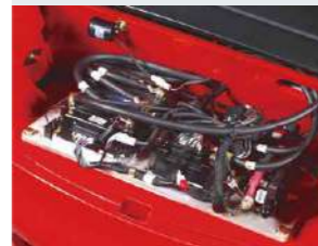
Imported high performance, and new generation AC controller