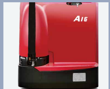
Designed to be narrow with large round corners to improve suitability for concentrated shelves and with a wedge-shape chassis to provide higher passing ability