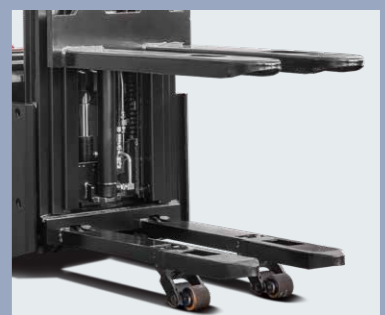
With the upper and lower pallet handling design to meet the stacking operation need and enable a higher efficiency of goods handling